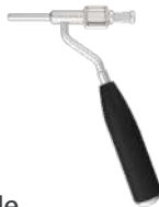
Drill Guide 202-1101